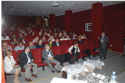
Diyabet ve Obezite Eğmm Kursu, Yalata

Yalata in November 2011 and 97 participants attended. The training was provided by a nutritionist, an expert in diabetics and an expert in food safety who examined the correlation of food safety with additives and genetically modified foods (GMO).