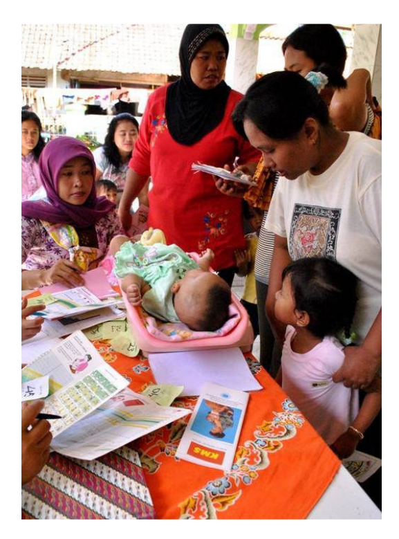
FRESH is implemented in close coordination with city governments, relevant national government agencies and their counterparts at the local level, donors with existing related projects in the

Malnutrition threatens the health and wellbeing, and ultimately the future, of Indonesian and Filipino children. It is critical that families and communities have the tools to prepare for, and respond to, the child hunger crisis. In 2009, Kraft Foods partnered with Save the Children to launch the Future Resilience and Stronger Households (FRESH) programme. The three-year programme reaches more than 180,000 children and families in in Indonesia and the Philippines where the prevalence of malnutrition has been made even more acute by the global hunger crisis. The goals of the FRESH programmes are to provide more food to more families to alleviate immediate hunger-and to strengthen local knowledge and skills so that positive health and hygiene behaviours are learned and practiced at the household and community levels, leading to improved nutritional status in the long term.