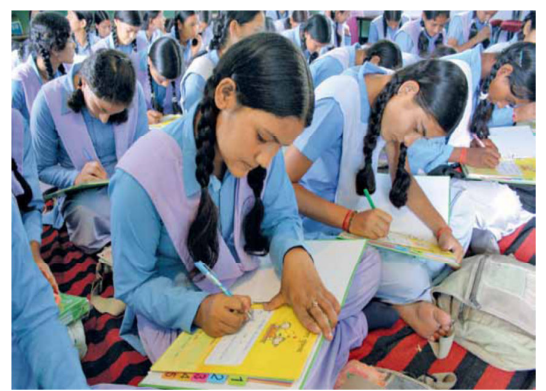
Reaching 25,000 children in Pakistan

The epidemic of obesity and overweight poses a major challenge to the prevention of chronic non-communicable diseases throughout the world. In some developing countries, it presents a double burden alongside enduring problems of under-nutrition, especially among children. Dealing with this issue requires the involvement of governments, scientists, academia, consumers, health leaders, and the food and beverage industry. Getting regular physical activity and establishing healthy eating habits help children achieve and maintain a healthy body weight, which will enable them to become healthy adults. Education is a powerful tool for ensuring that children understand the value of nutrition and physical activity to their health throughout the course of their lives.