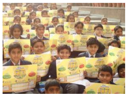
Promoting Energy Balance in Delhi

Education is often a privilege rather than a right for the children of India. For lower-class Indian children, education is neither consistent nor secure. The Swashrit Society is a national charity, with a mission to educate children for a better tomorrow. Focused on empowering youth by providing them with literacy, education and awareness programmes to create better health, the organization works to provide the underprivileged with equal opportunities of learning in the formative years and engage students of public and private schools in various health education initiatives. As part of PepsiCo's commitment to promoting healthy lifestyles in schools, the Get Active project, an active lifestyle movement for school children was initiated in 2006 in partnership with the Swashrit Society, Hriday and the Indian Dietetic Association. This school-based edutainment programme has a central objective - "to raise awareness on the importance of balanced nutrition and regular physical activity for a healthy lifestyle among children."