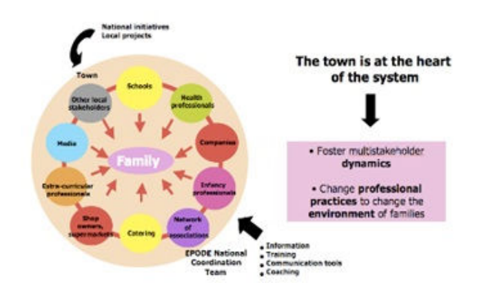
Figure 1: EPODE Concept

Regional Hospital Centre. While recent data available in France at national level show an overall stabilization in the prevalence of childhood overweight and obesity, results from the French EPODE pilot towns show a significant decrease in overweight and obesity: 9.12% between the years 2005 and 2009, i.e. a reduction from 20.6% in 2005 to 18.8% in 2009 (p<0.0001). Prevalence in overweight decreased from 15.8% in 2005 to 14.4% in 2009 (p<0.0001) and prevalence in obesity decreased from 4.8% in 2005 to 4.4% in 2009 (p=0,056).