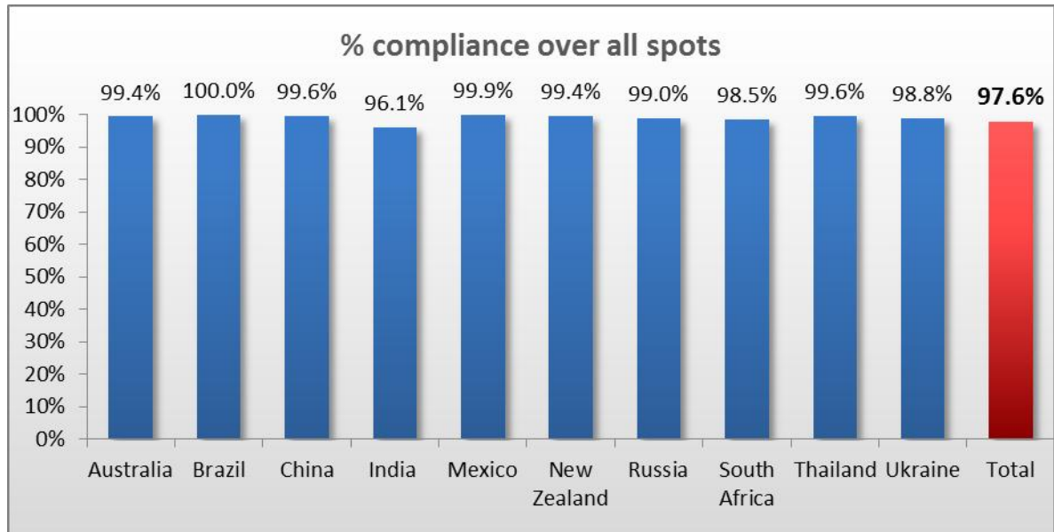
Fig. 1: Television - Overall 2011 Compliance Results (All spots included)